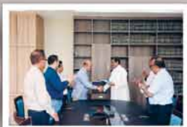
MoU with NE Cancer Hospital and Research Center