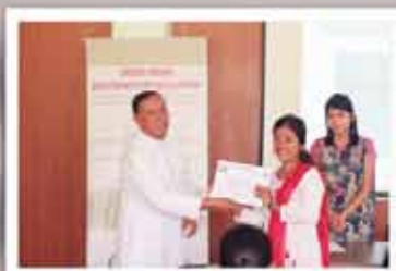
Workshop for Anganwadi Workers