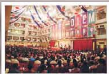
Sixth Convocation of the University