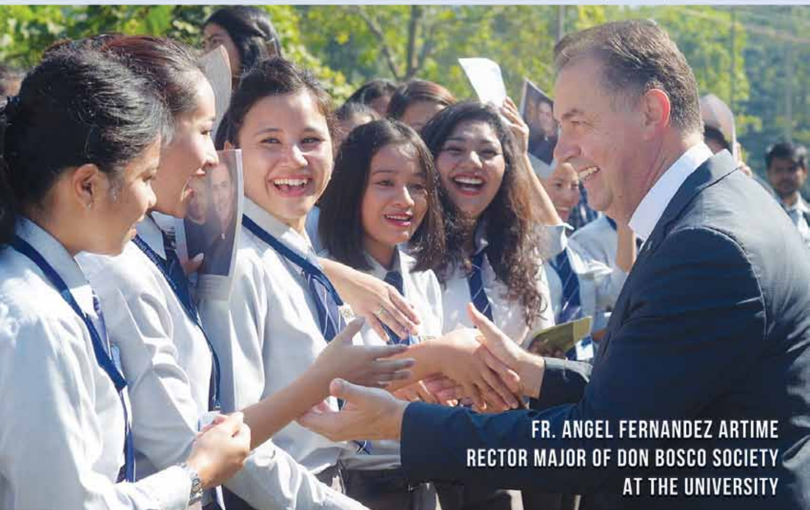
FR. ANGEL FERNANDEZ ARTIME RECTOR MAJOR OF DON BOSCO SOCIETY AT THE UNIVERSITY